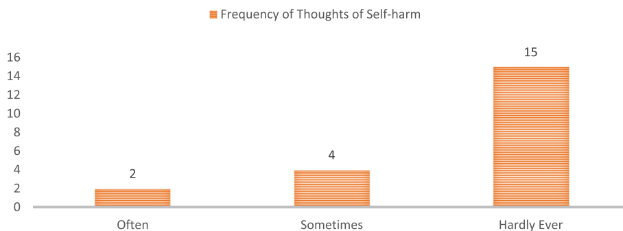
Fig. 3 Frequency of Thoughts of Self harm